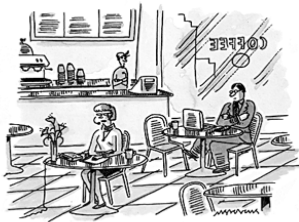
"Braithwaite & Starbucks. How may we help you?"

like an anvil), and the stapes (similar to a stirrup). These bones amplify the sound vibrations and transmit them to the inner ear, where the cochlea converts the vibrations into electrical impulses, which travel from the acoustic nerve to the part of the brain that processes sound, the auditory cortex. Tinnitus can be temporary, caused by excess wax, an infection of the inner ear, or the toxic effects of drugs like aspirin (which appears to weaken the neural signals from the ear to the brain) or those used to treat cancer. Some people with normal hearing develop spontaneous tinnitus when placed in total silence; this is believed to be a response of the auditory cortex to the abnormal absence of all ambient sounds. But the majority of people with chronic symptoms develop them in conjunction with hearing loss. With the recent proliferation of MP3 players, rates of hearing loss and tinnitus may rise sharply in the coming years. A recent European Union study has projected that as many as ten million Europeans may be at risk of developing severe hearing loss as they age; and, according to the American Academy of Audiology, noise-induced hearing loss affects about one out of every eight children in the United States.